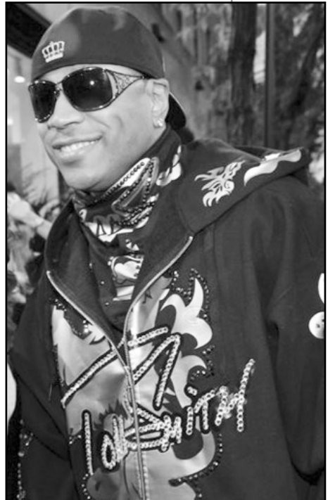
LL Cool J

TODAY'S HIP-HOP fashion is a melding of the styles before it, often characterized by sagging pants, bandanas, jewelry and big, baggy shirts. Hip-hop isn't limited strictly to street wear, as many designers such as Tommy Hilfiger and Polo contribute designer items to style.