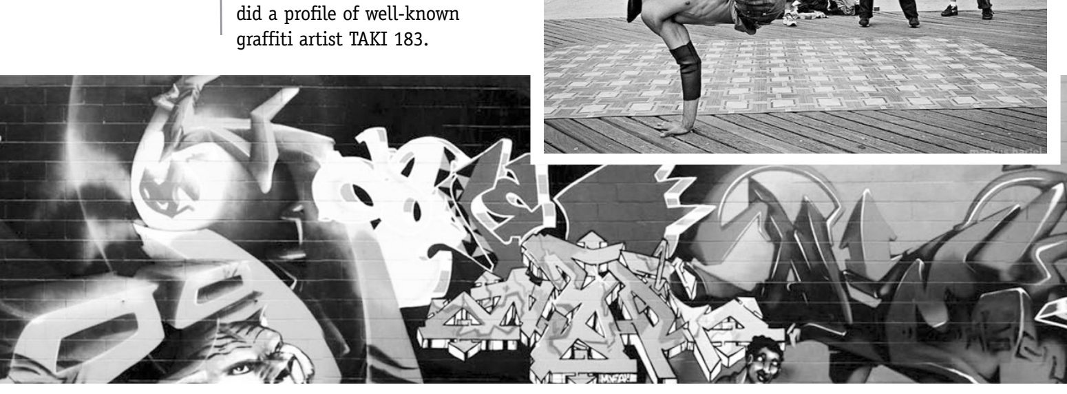
raffiti art wall by Stick Up Kids, a writing crew with members from Germany, New Zeland, Thailand and Denmark

BREAK DANCING is also a part of the evolution of hip-hop culture, an element that grew alongside rap and DJ-ing. While