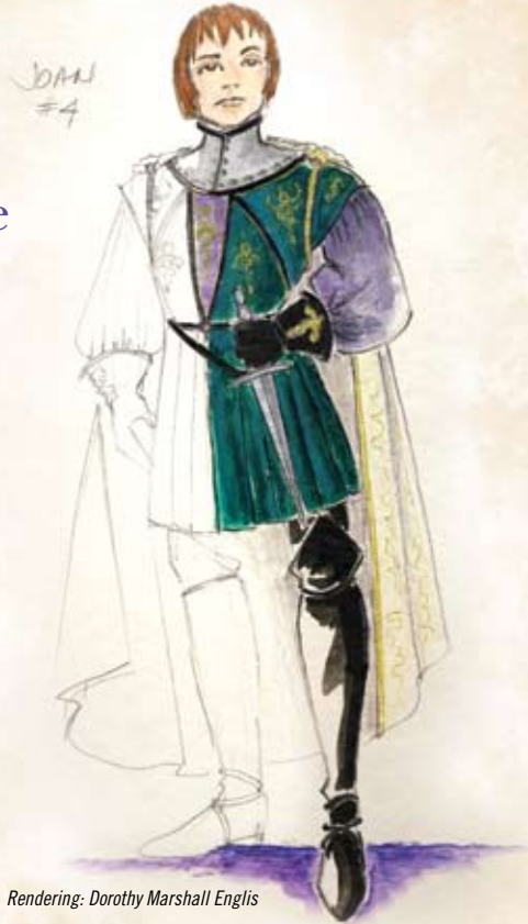
Rendering: Dorothy Marshall Englis

Your Planned Gift to The Rep can be tailored to your most exacting requirements.